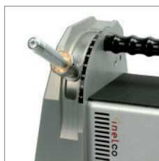
Grind the electrode in the desired angle.