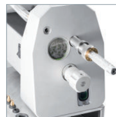
Cut the electrode by turning the handle.